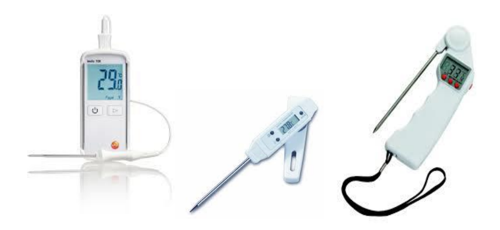
Figure 3. Examples of digital probe thermometers

Food businesses are encouraged to purchase thermometers with a narrow temperature range, as these thermometers will provide greater accuracy at a cheaper price. A thermometer that has a range of -50°C to +150°C is all that is required for measuring the temperature of food.