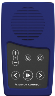
1 x Envoy Connect Player