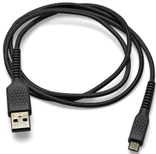
1 x USB Charging Cable