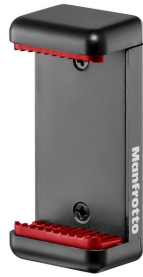
1 x Phone Clamp