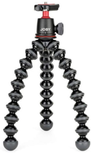
1 x Mini Tripod