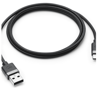
1 x USB power cable

This item MUST BE returned to the library desk during branch opening hours.