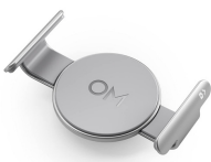
1 x Magnetic phone clamp