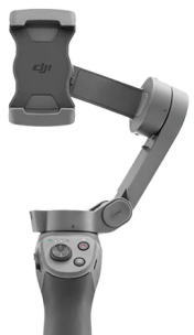
1 x Gimbal