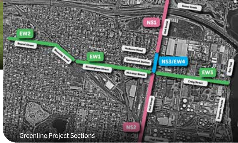
Greenline Project Sections