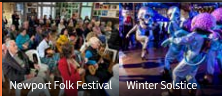
Newport Folk Festival