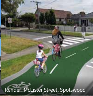
Render: McLister Street, Spotswood