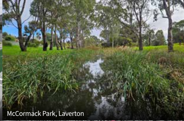
McCormack Park, Laverton