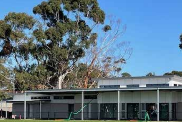
Altona City Soccer Club upgrade - HC Kim Reserve, Altona