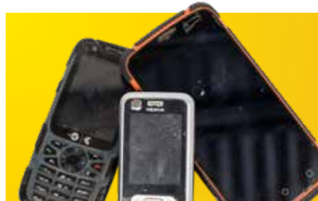
MOBILE PHONES & ACCESSORIES

Program at capacity, resuming February 2025