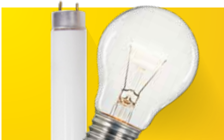
LIGHT GLOBES & TUBES