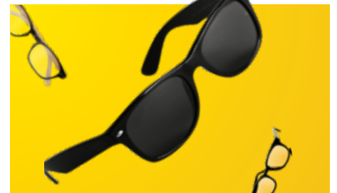
GLASSES (READING & SUNGLASSES)