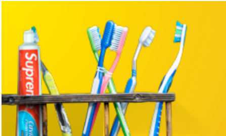
TOOTHPASTE & ORAL CARE PRODUCTS

You can now recycle common household items across Hobsons Bay!