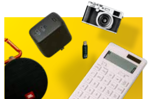
SMALL E-WASTE ITEMS